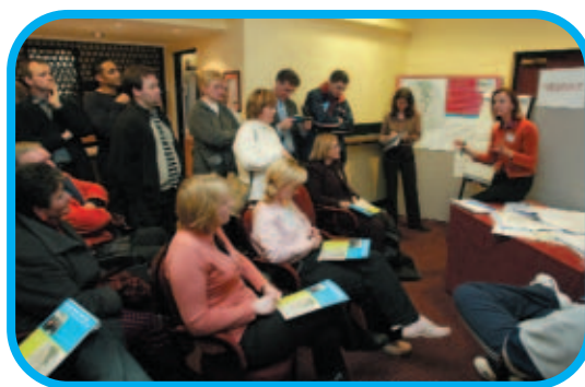
Lawley Village Group

A Traffic Movement study is being carried out to assess the impact of the plans on traffic and all the related issues. The findings will enable us to revisit the plans to ensure the planning application addresses the issues raised.