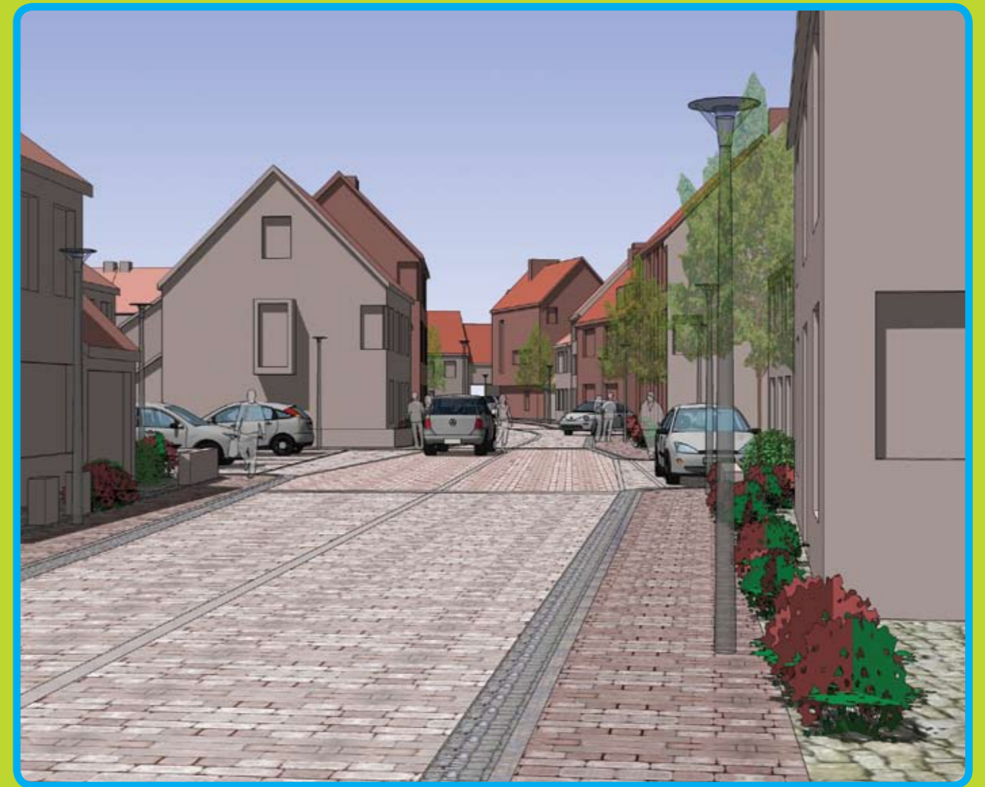
LAWLEY VILLAGE NEIGHBOURHOOD CHARACTER AREA- TYPICAL VIEW