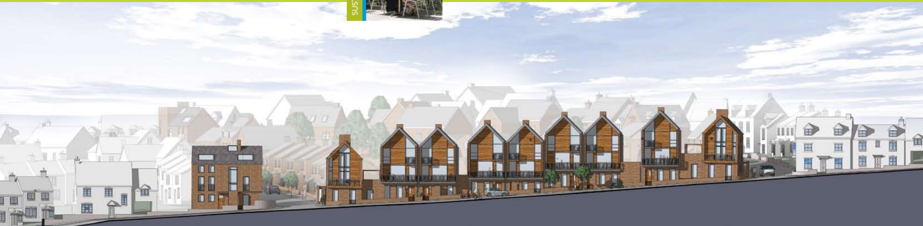
NEWDALE NEIGHBOURHOOD CHARACTER AREA - ELEVATIONS FRONTING ONTO PUBLIC OPEN SPACE