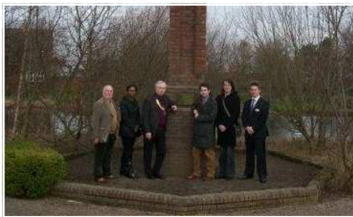
Picture: Representatives from Lawley and Overdale Parish Council, Telford and Wrekin Council, The HCA and IMS.

The Village Green in Lawley was officially declared 'open' at a re-dedication ceremony held on 12th March 2011. The greens were awarded Village Green status which secures them as open space for the community.